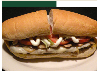
Steak "Ruthies Way"