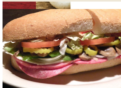
Sub "All the Way"